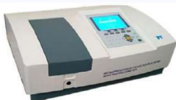
Double Beam UV Spectrophotometer