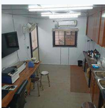
Organic Chemistry Lab