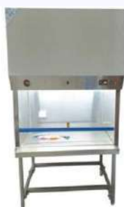
Laminar Air Flow