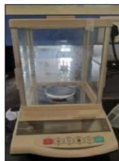
Digital Weighing Balance