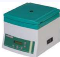
High speed centrifuge (16k rpm)