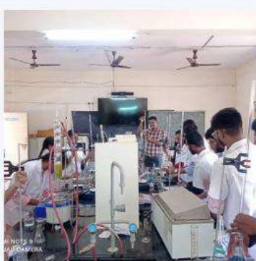
Inorganic Chemistry Lab

The following laboratory facilities available for B.Sc (Honors/Honours with Research) Chemistry and M.Sc (Chemistry) students of Central Tribal University of Andhra Pradesh. All the Laboratories are equipped with basic instruments for experiments in Inorganic Chemistry, Organic Chemistry and Physical Chemistry allowing students to familiarize themselves with fundamental concepts in chemistry.