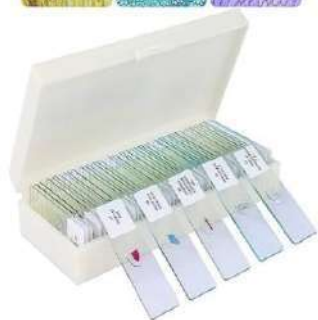
Permanent glass slides containing specimens