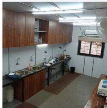
Physical Chemistry Lab